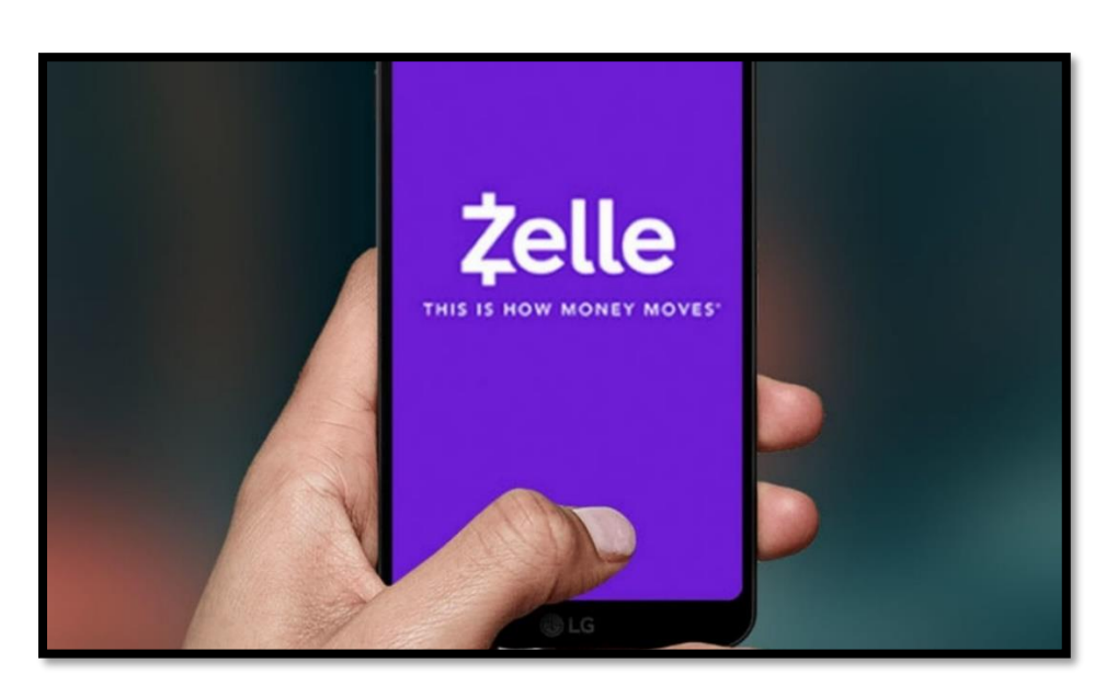
Got Zelle? Home & School Does!

Please feel free to use Zelle to send money for the 5k registrations and sponsorships (just choose "cash" on the online payment dropdown and send us an email giving us a heads up). It is a fast and secure way to send money free. Use our email in Zelle to send payments - <a href="mailto:homeandschool@springvalleyacademy.org">homeandschool@springvalleyacademy.org</a>. To learn more, visit <a href="https://www.zellepay.com/how-it-works">https://www.zellepay.com/how-it-works</a>.