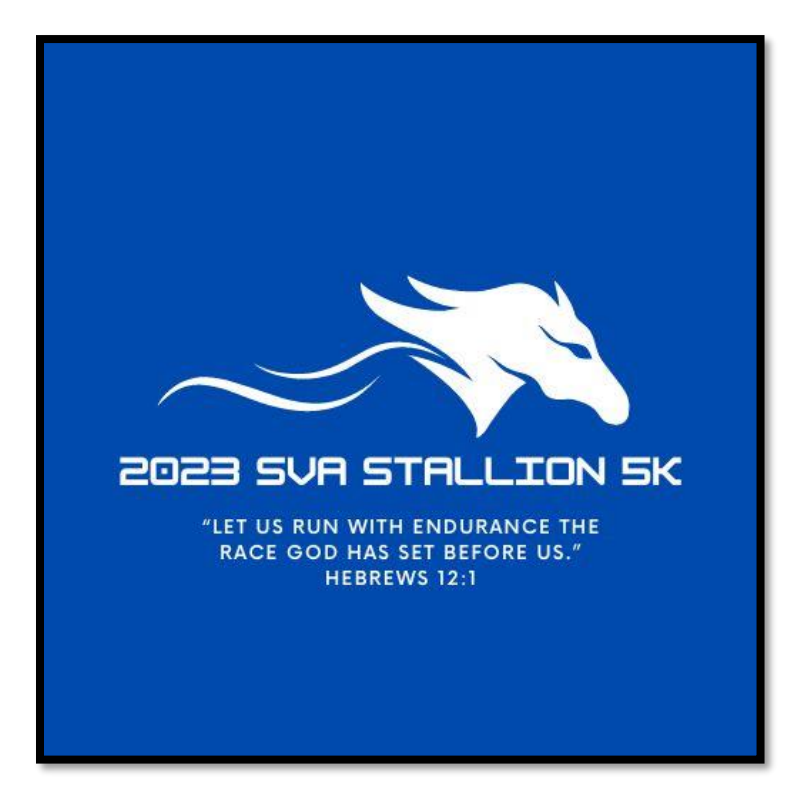
T-Shirt Front Design

Don't miss out on having your business logo or a family name (ex. "The Smith Family") featured on the back of the race t-shirts. Bonus for SVA students – t-shirts are also SVA approved Friday spirit wear.